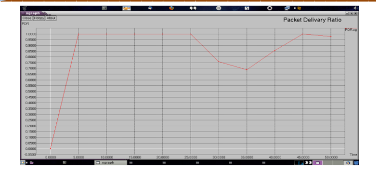
Fig 3: Packet Delivery Ratio